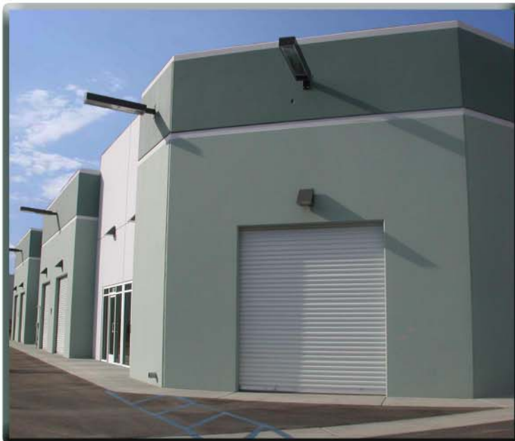
Rio Nedo Street